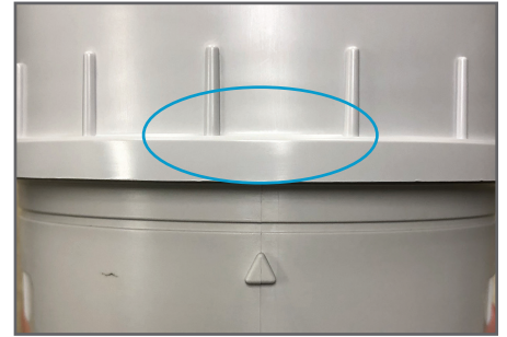
Swiping Location to Wake Monitor