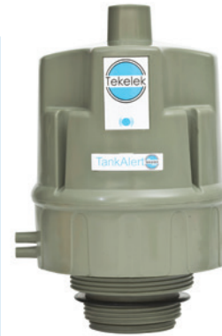
TSUT811 13 ft Range

The monitors are ideally suited for remote customer tanks that are located in climates that remain above 32° F. The monitors read once per hour and report on exception if a > 2" level change is detected. The maximum scheduled report is once per day. A manual and immediate report can be triggered by holding a magnet under the LED for 5 seconds. The monitor is available in two models that offer a 13 ft and a 26 ft range.