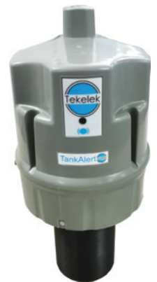
TSUT900 26 ft Range