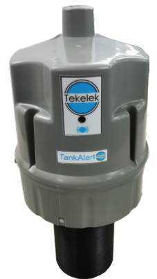
TSUT900 26 ft Range