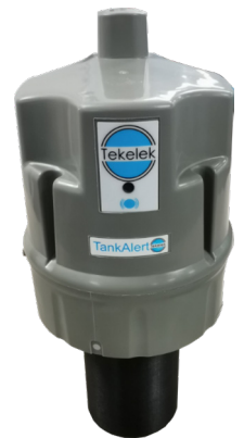
TSUT900 26 ft Range