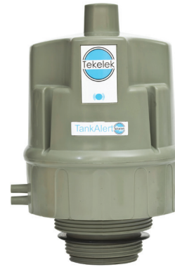
TSUT811 13 ft Range

The monitors are ideally suited for remote customer tanks that are located in climates that remain above 32° F. The monitors read once per hour and report on exception if a > 2" level change is detected. The maximum scheduled report is once per day. A manual and immediate report can be triggered by holding a magnet under the LED for 5 seconds. The monitor is available in two models that offer a 13 ft and a 26 ft range.