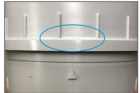
Swiping Location to Wake Monitor