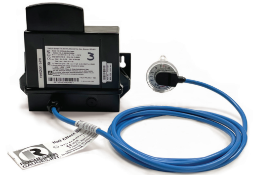
TSD822 Dial Gauge Reader

The AquaPhoenix Intelligence Platform (AIP) provides tank level information via TankScan monitors anywhere an Internet connection is available - via computer, tablet or smart phone. Use TankScan analytics to optimize business decisions around operations and logistics by knowing when a tank is in need of service. Plan fluid deliveries and pick-ups based on the latest information to insure optimal route efficiencies and maximize customer service.